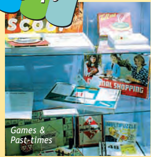
Games & Past-times