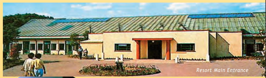
Resort Main Entrance