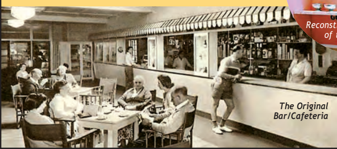
The Original Bar/Cafeteria

Also included are the 'Hoppers' uniform of the 1950s, advertising leaflets, menus and entertainment brochures. In particular, take a close look at the Resort 'coupons'. These were used