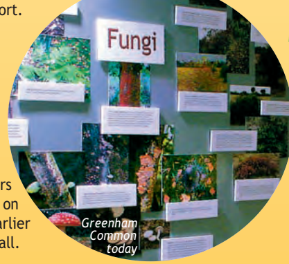
Greenham Common today

Since that time 'Greenham Common' has begun to grow, develop and thrive, not only as a Common, but also as a nature reserve. Much wildlife has re-established itself and the grounds returned to the archetypal Common with gorse, heather, specialised cattle, ponies and much else.