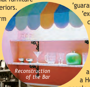
Reconstruction of the Bar